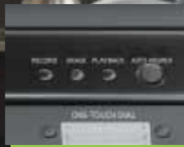
Fully Digital Answering System*