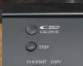
Caller ID*1 Ready