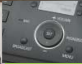
Navigator Key for Easy Operation