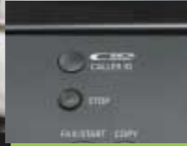
Caller ID*1 Ready