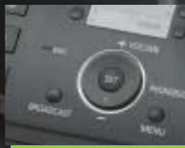
Navigator Key for Easy Operation