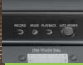
Fully Digital Answering System*